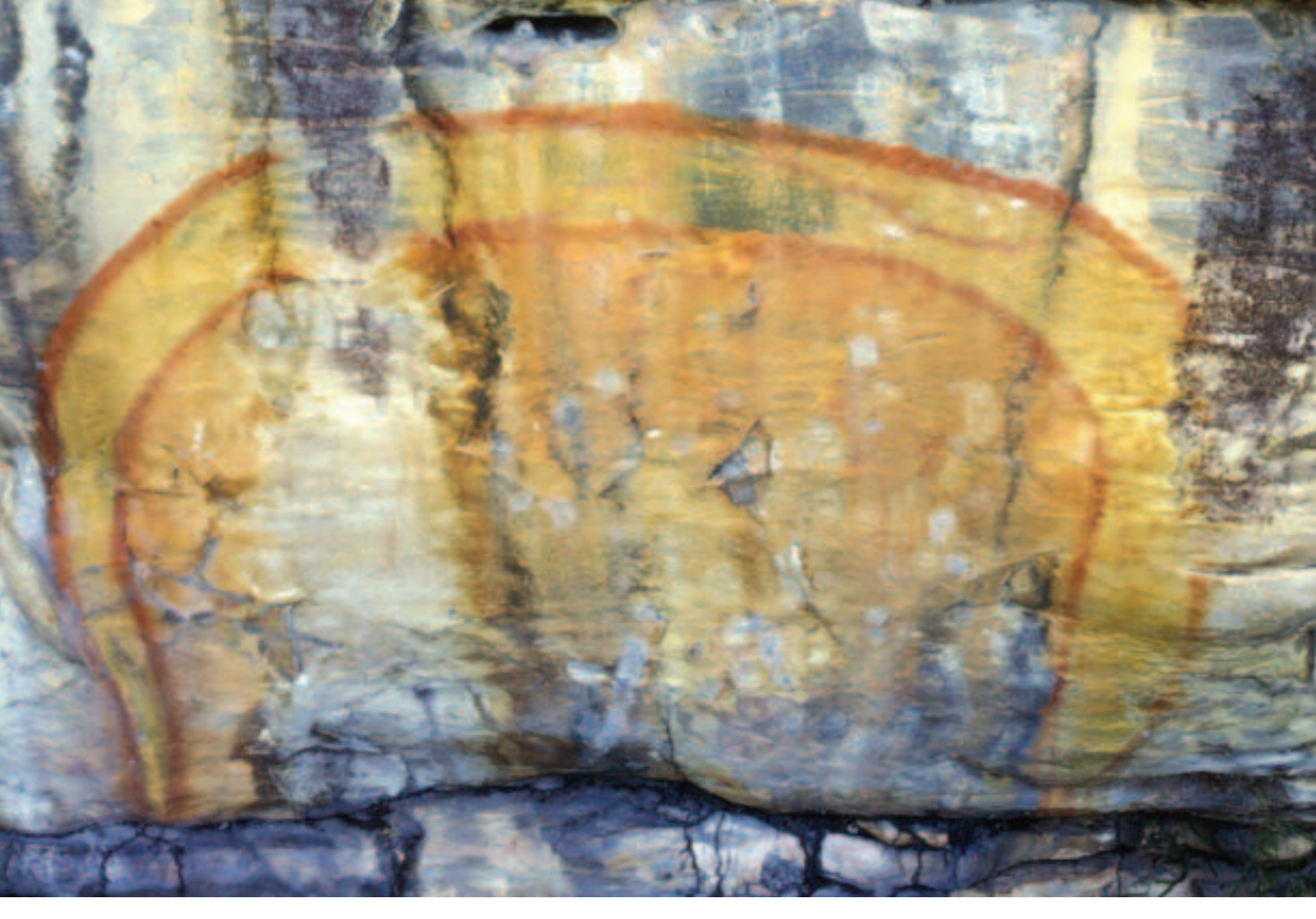
Across Aboriginal Australia, Rainbow Serpents figure prominently in art, stories, and ceremony. Sometimes when entering a rock wall they left their image behind, such as this location near the East Alligator River in Kakadu National Park.

sea eagle, the largest predatory bird of the area, which subsists mainly on fish. At night he appears in the sky as a shooting star. It is said that Namorodo takes the souls of the dying away from their bodies.