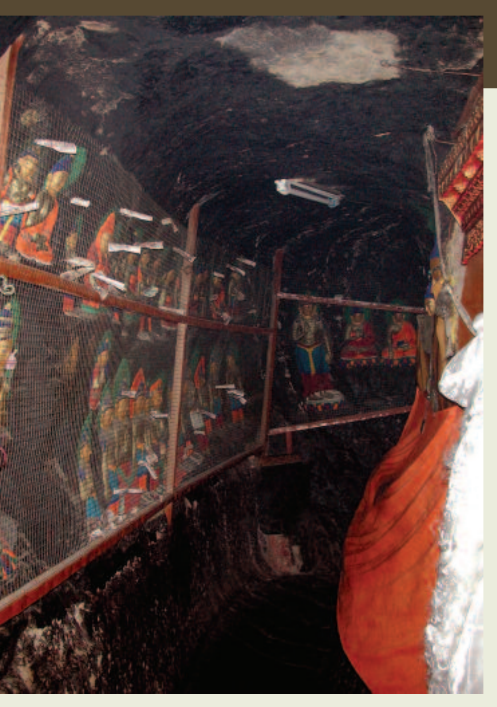
Representations of the Buddha Sakyamuni, bodhisattvas, and historical figures—some more than 1,000 years old—are carved on the walls of Palha Luphuk, a cave excavated into the living rock.