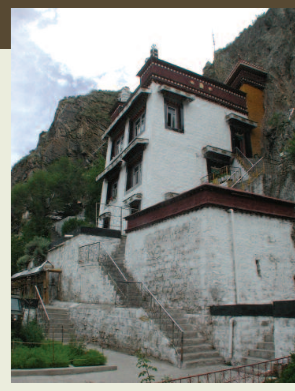
The cave temple of Palha Luphuk in Lhasa provides access (through the upper door on the right) to the cave supposedly used by Songsten Gampo, the Tibetan Empire's first Buddhist ruler.

Although cave systems like the Guru Rinpoche complex have been modified by later generations who built shrines and