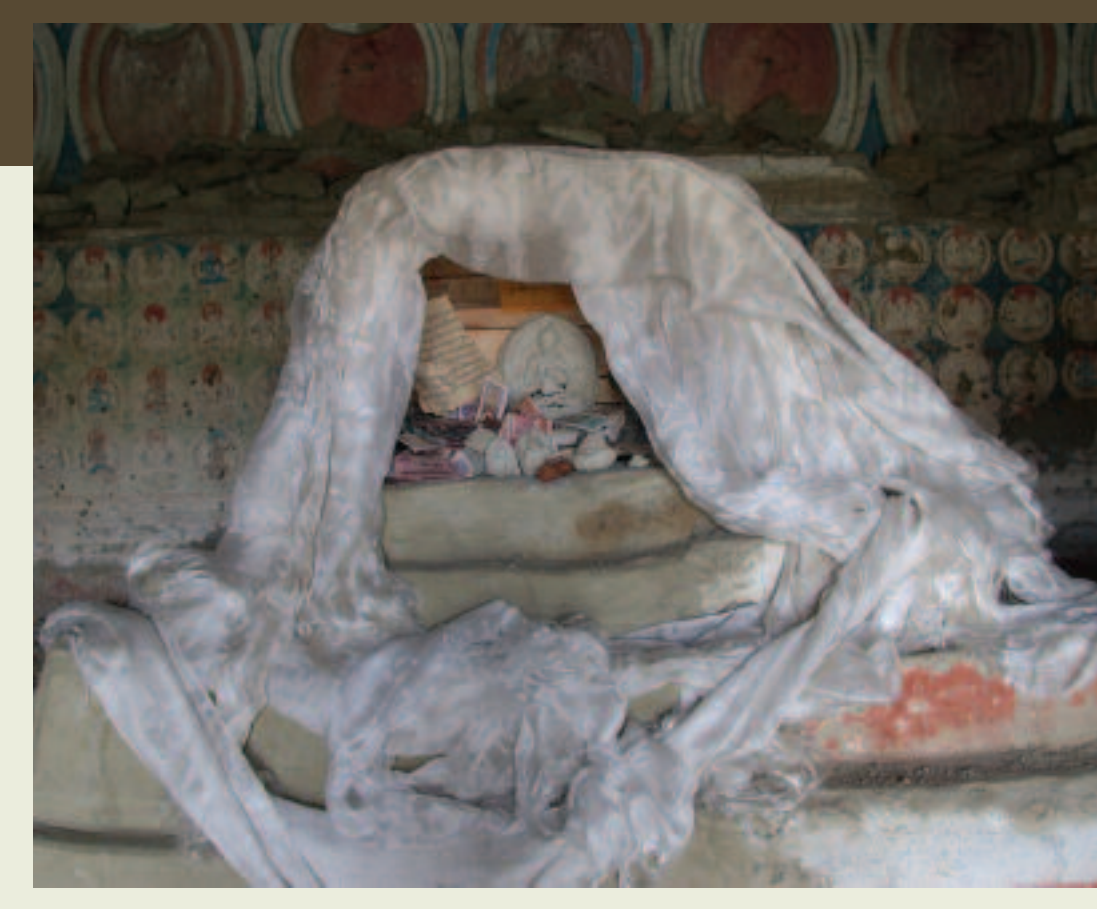
An altar found in a cave temple near Piyang is draped in khata (white ceremonial scarves). Tsa-tsa, bank notes, and pages of writing are placed upon it.

Aldenderfer, M. "Piyang: A 10th/11th C A.D. Tibetan Buddhist Temple and Monastic Complex in Far Western Tibet." Archaeology, Ethnology, and Anthropology of Eurasia 4-8 (2001):138-46.