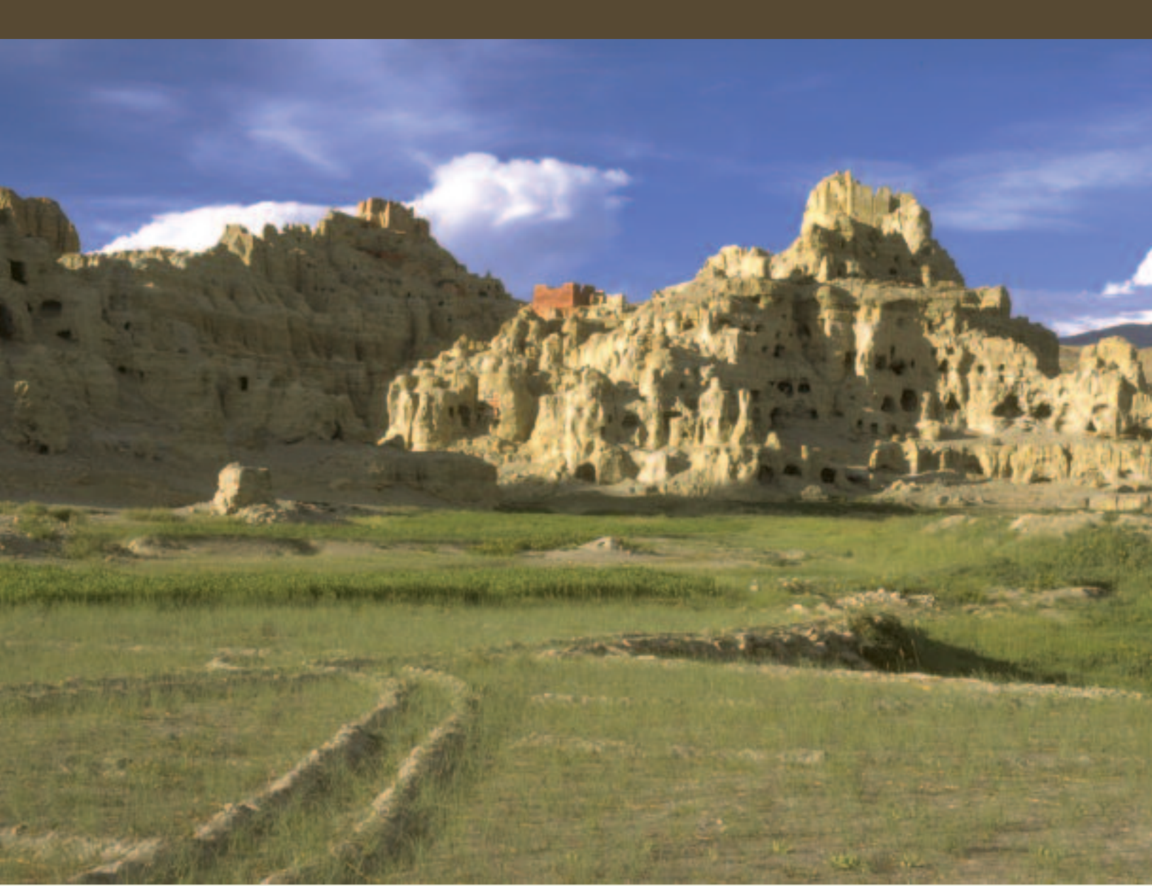
At Piyang in western Tibet many caves have been dug into the face of the mesa.