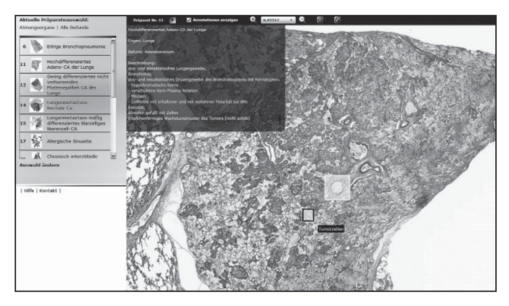
The portal for web-based microscopy offers students an extensive collection of specimens.